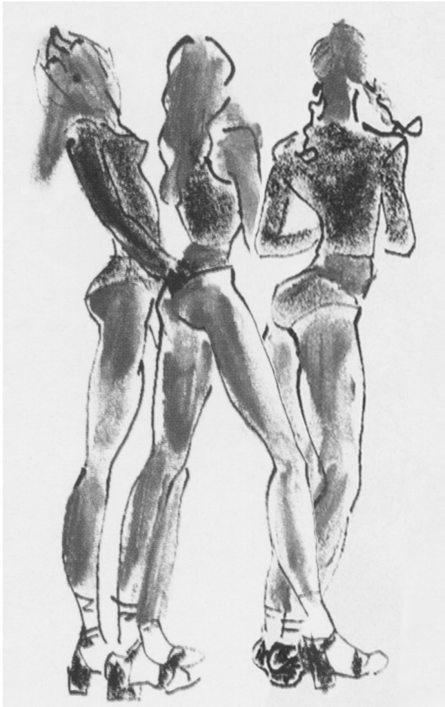
Innocent looking, long-legged pubescent body proportions. Drawing by Gladys Perint Palmer, Vogue Australia , May 1994