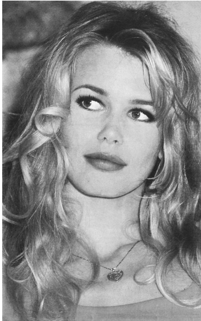
Innocent, child-like, youthful, neotenous features. German supermodel Claudia Schiffer, The Daily Telegraph-Mirror , 1 Nov. 1994